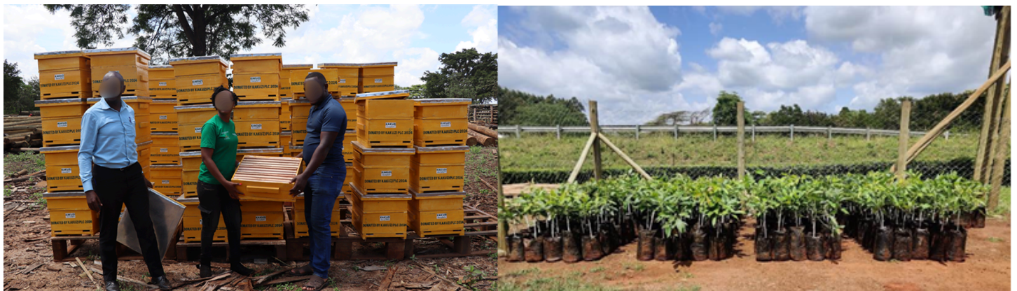
Photos 10: Beehive & Avocado tree seedlings donation to Community development programs in Muranga County

As part of Kakuzi efforts to support sustainable development and the local community economic growth, The Company donated 50 beehives, 200 beehives and 200 avocado tree seedlings to Community Development programs through Betty Maina foundation and Irungu Nyakera foundation respectively, to be distributed to farmers throughout the 6 sub counties in Murang'a County.