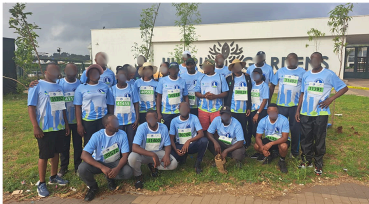
Photos 11: Kakuzi employees during 2024 Standard Chartered Marathon

Kakuzi sponsored 31 Members of staff to take part in 2024 Standard Chartered Marathon. This year's Marathon focused on Future makers initiative to tackle social and economic inequality focusing on disadvantaged young people, women and people with disability to learn, earn, and grow. Since its launch in 2019, Future makers programs have reached more than 24,500 beneficiaries in Kenya.