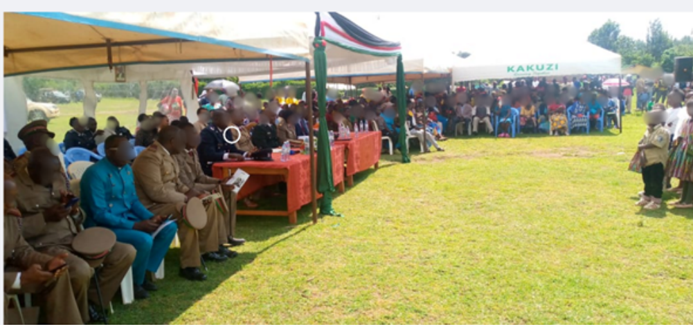
Photos 15: Jamhuri day celebrations in Huhoini Sports grounds Kambiti Muranga South Sub County

Kakuzi was part of the celebrations in both Ithanga/Kakuzi and Muranga South Sub counties through provision of tents, seats and other items in fulfilling requests extended to the Company.