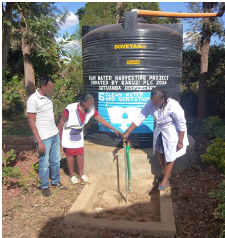
Photos 3: Members of staff at Gituamba Health Facility during handing over of the rain water harvesting system

Promoting access to quality health care remains a priority for Kakuzi, in line with this, Kakuzi handed over a 10,000L rain water harvesting system to Gituamba Health facility to increase access to clean water to the facility personnel and over 150 community members who seek health services from the facility on a daily basis.