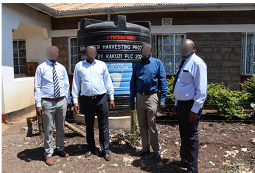
Photos 8; Government officials during handing over of the rain water harvesting system at Muranga south Subcounty offices

In attempting to providing a long-term solution to this challenge, Kakuzi funded construction of two, 5000-litres rain water harvesting systems in Murang'a South Sub-County Education office and Registrar of Persons office. This will increase access to clean water for over 400 community members accessing services and staff personnel in these institutions.