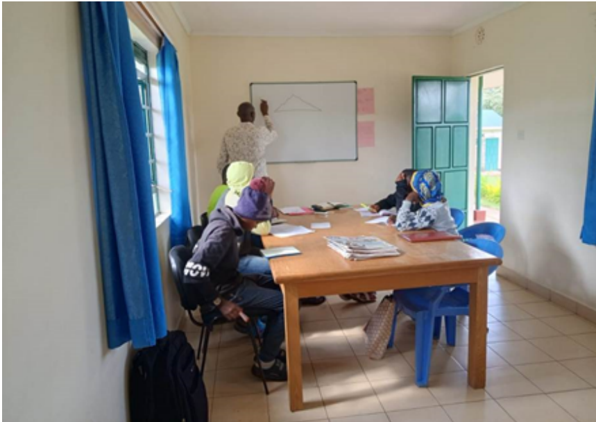
Photos 6: Kakuzi sponsored students mentorship session at Kinyangi Community center

During the April school holiday, Kakuzi organized a mentorship forum for its seven sponsored students. The forum focused on reviewing their 2025 academic targets, providing guidance on study skills, and assigning termly tasks. For second term, each student is expected to visit their former primary school to mentor and motivate Junior Secondary school students.