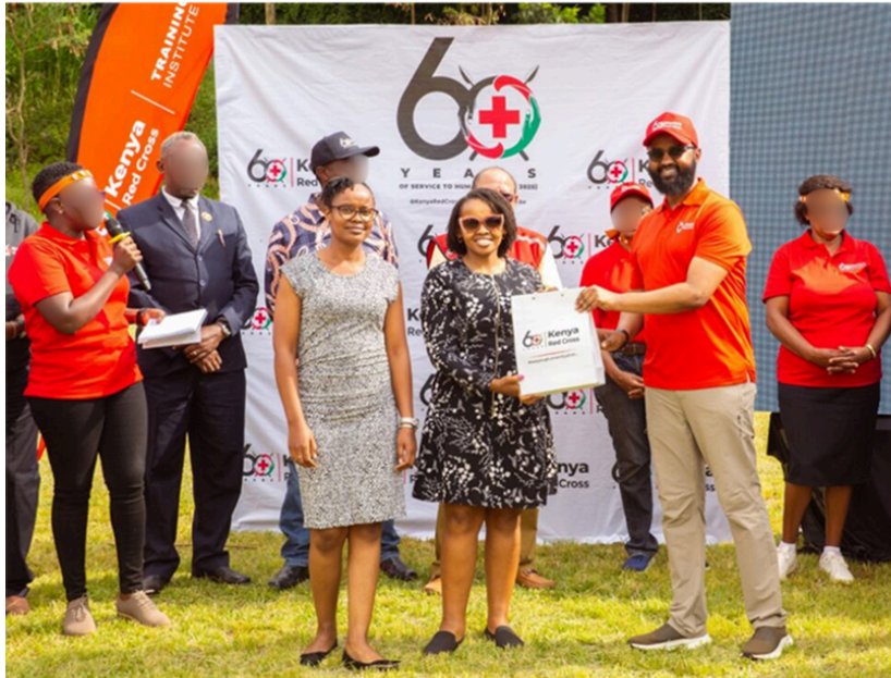
Photos 13: Kakuzi staff receiving a golden company award during World Red Cross day