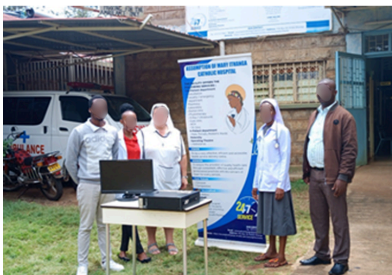
Photos 3: Mary Ithanga Hospital staff members receiving a desktop computer from kakuzi

In an effort to promote access to quality basic health care, Kakuzi donated a desk top computer to increase efficiency in storage and access to patient data at Mary Ithanga Hospital, a catholic hospital that offer medical services to the local community and serves over 100 patients on a daily basis.